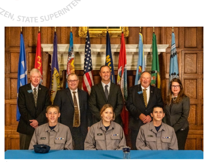
(Supt. Arntzen with Montana Youth Challenge Academy Cadets and legislators following the bill signing for HB 556 authorizing alternative diplomas)

This week the Legislative is expected to adjourn sine die – meaning our legislative session is complete! I am pleased to inform you that all of our priority bills for the 67th Legislative Session have crossed the finish line!