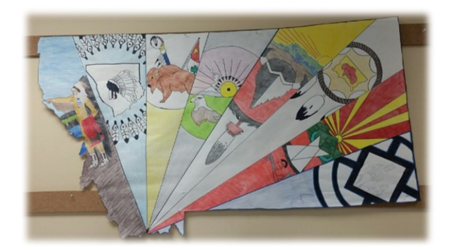
Map created by Carroll College education students.