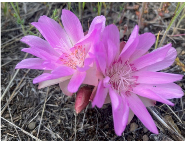
Image 1: Photo of the Bitterroot flower. 2020.