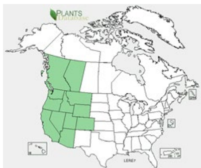
Lewisia rediviva range map. USDA PLANTS Database.

Distribution: Bitterroot is found in most of western and southern Montana, British Columbia to Alberta south to California, Arizona, and Colorado (Lesica 2012). This perennial plant, meaning it comes back year after year, is found between 60-10,000 meters in elevation, in open woodlands and sagebrush shrublands with pine, oak, or juniper in many soil types such as shale, sand, clay, granite, serpentine, or talus (Anderson and Roderick, 2000). It prefers full sun, sandy, well-drained soil and does not compete well with other plants nearby (Bitterroot 2021).