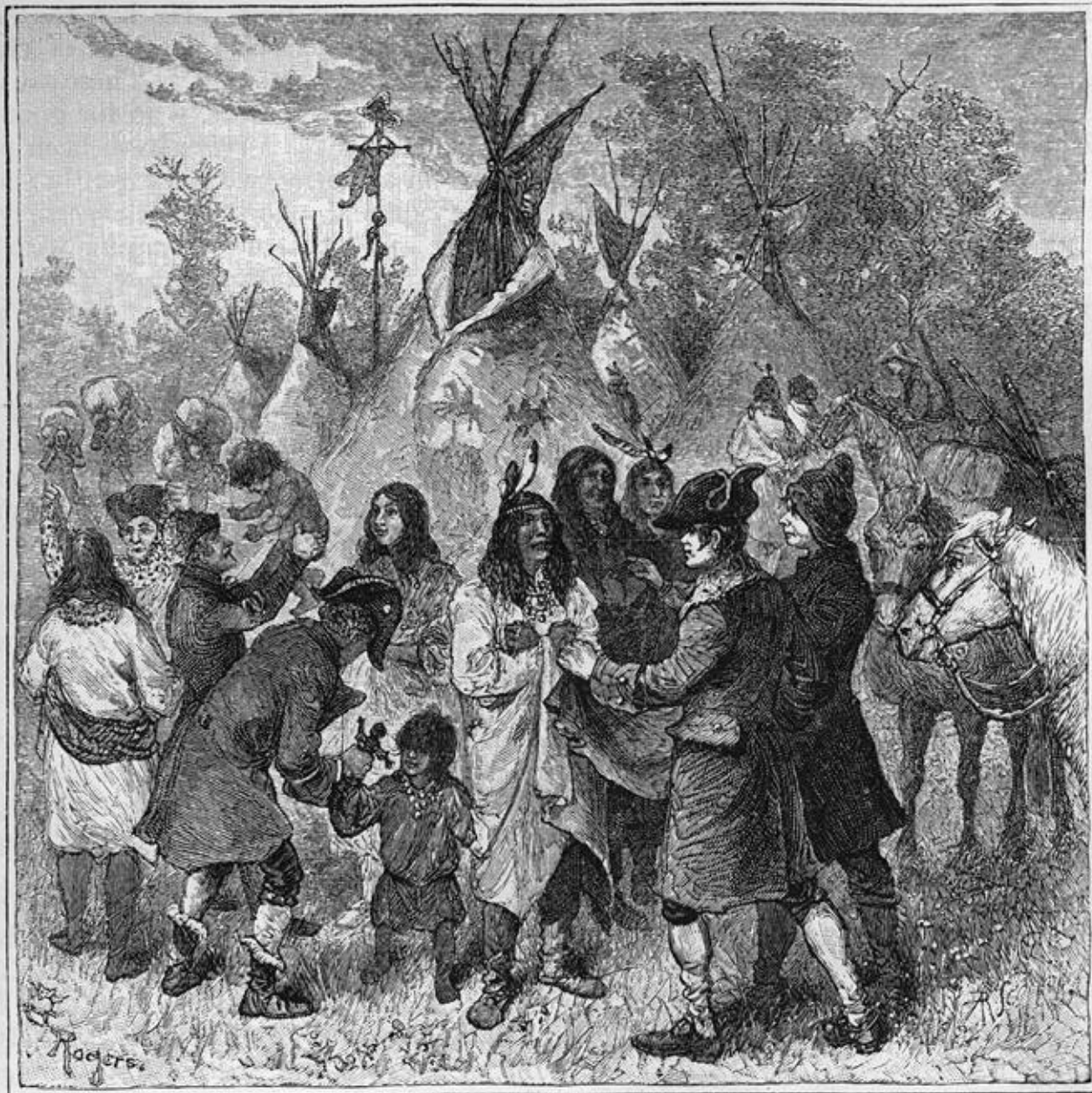
THE RIVAL COMPANIES SOLICITING TRADE A HUNDRED YEARS AGO.