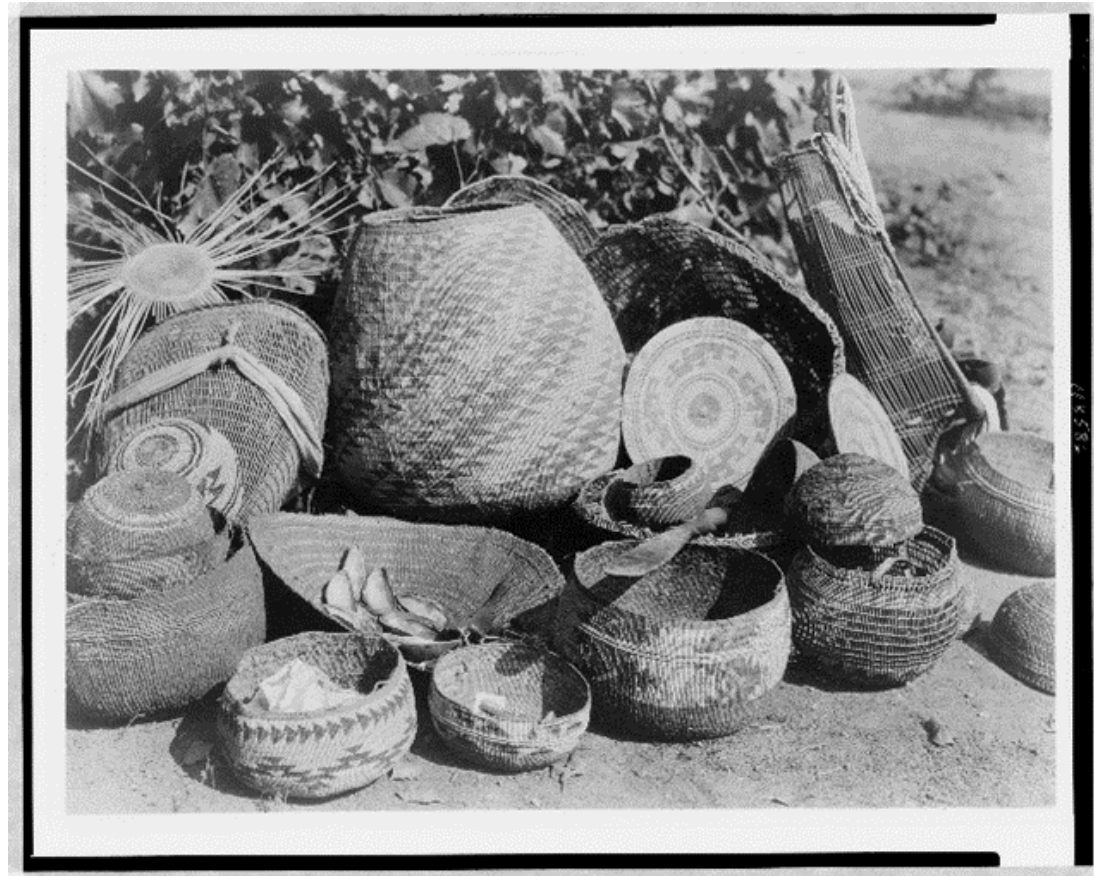
Storage baskets Karok

Curtis, Edward S, photographer. Karok Baskets . ca. 1923. Photograph.