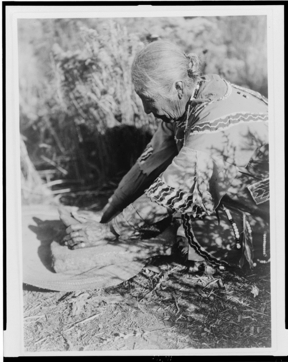
Stone grinder (wocas – water lily) Klamath

Curtis, Edward S, photographer. Grinding wocas--Klamath. ca. 1923. Photograph.