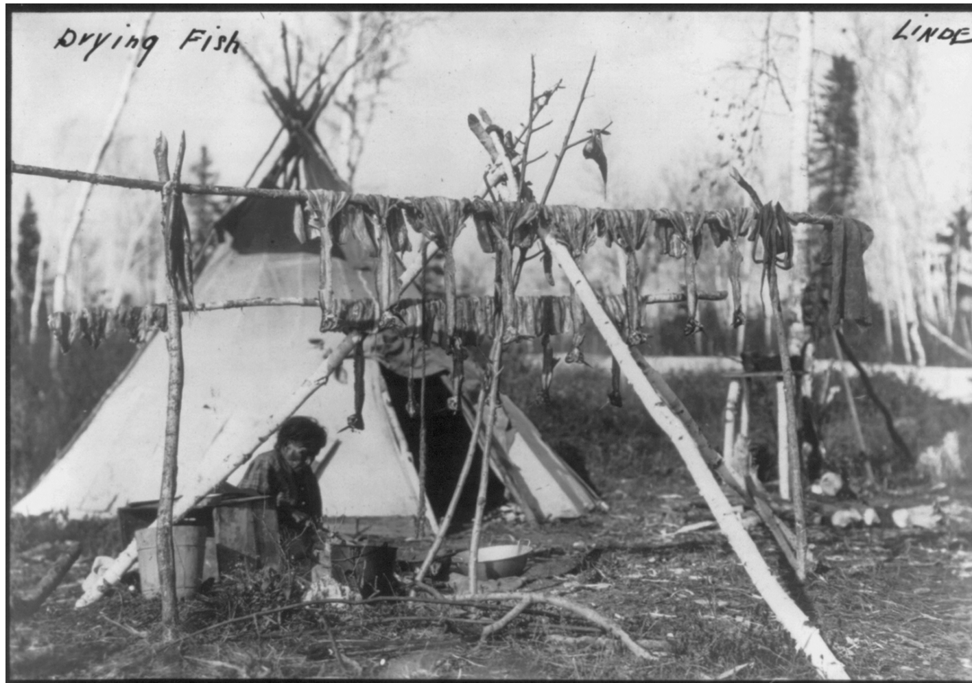
Drying fish Ojibwe

Elderly Indian woman outside teepee, with fish drying on poles in foreground. ca. 1913.