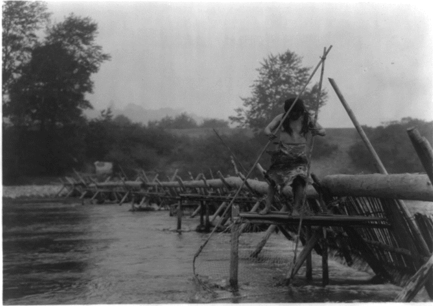
Fish trap Hupa

Fish-weir across Trinity River--Hupa. California, 1923. Photograph. https://www.loc.gov/item/90705519/.