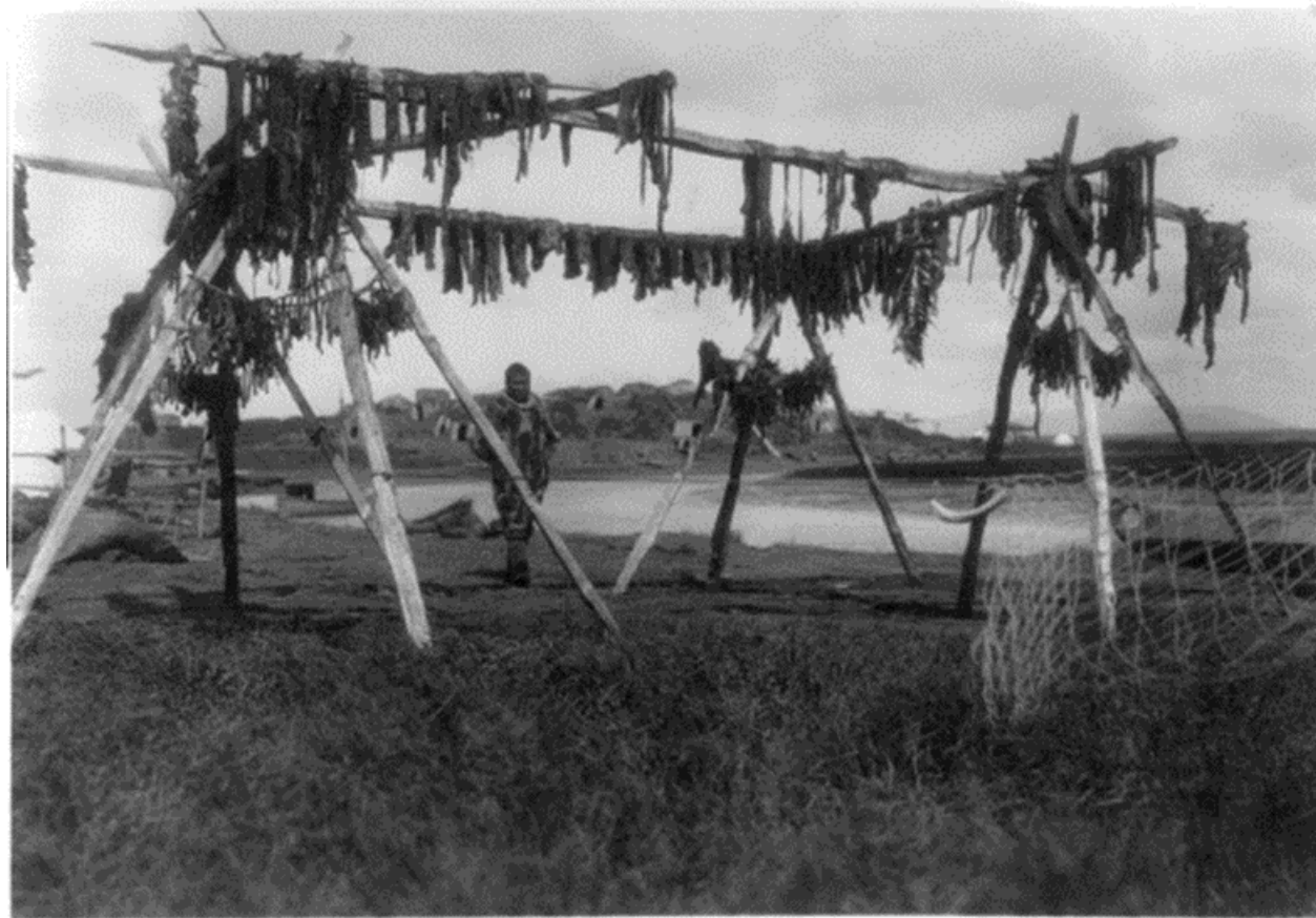
Drying whale meat Yup'ik Eskimo

Drying whale meat--Hooper Bay. Alaska Hooper Bay, ca. 1929.