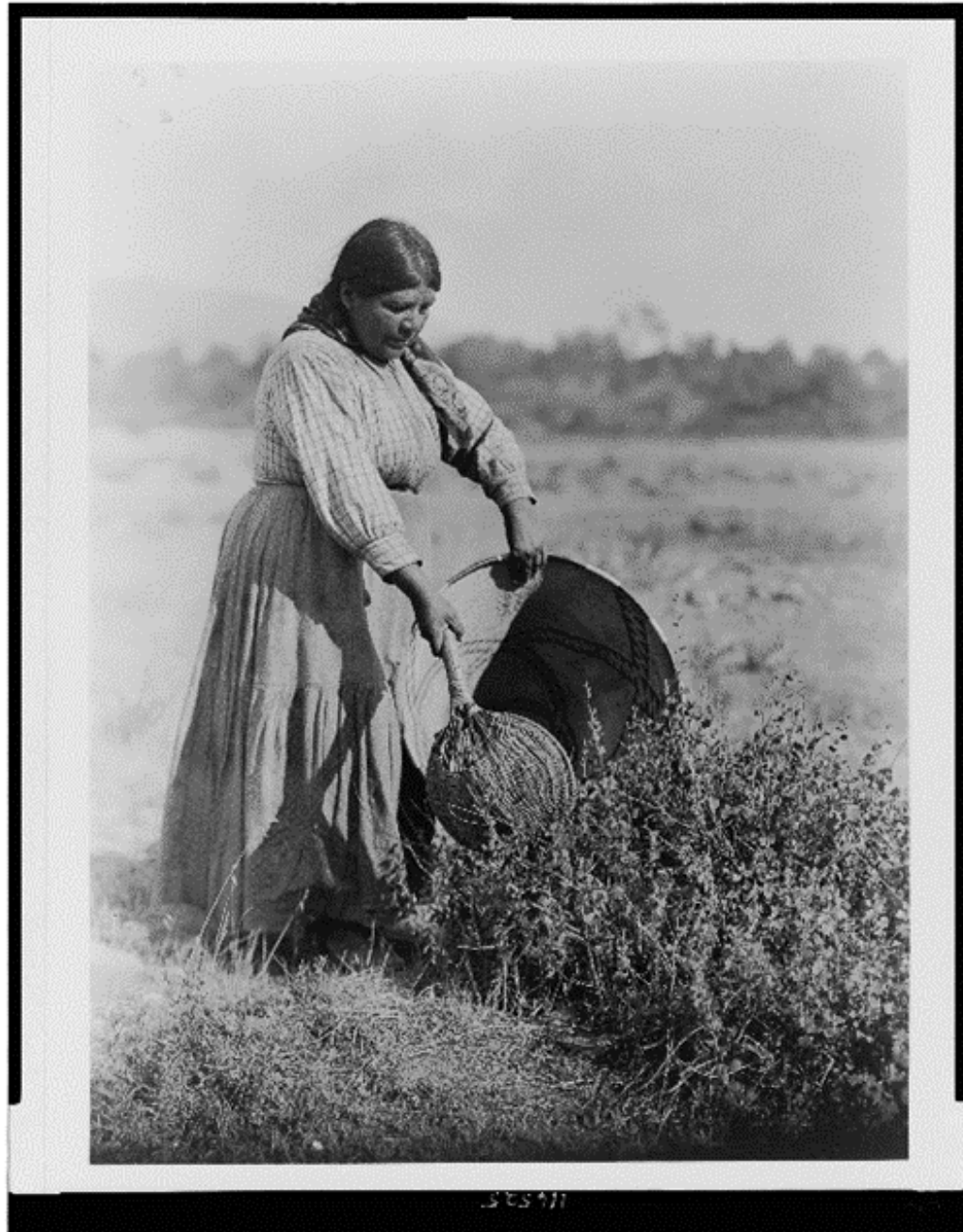
Seed beater and burden basket Coast Pomo (California)

Curtis, Edward. S, photographer. Gathering Seeds--Coast Pomo. ca. 1924. Photograph. https://www.loc.gov/item/2002695450/ .