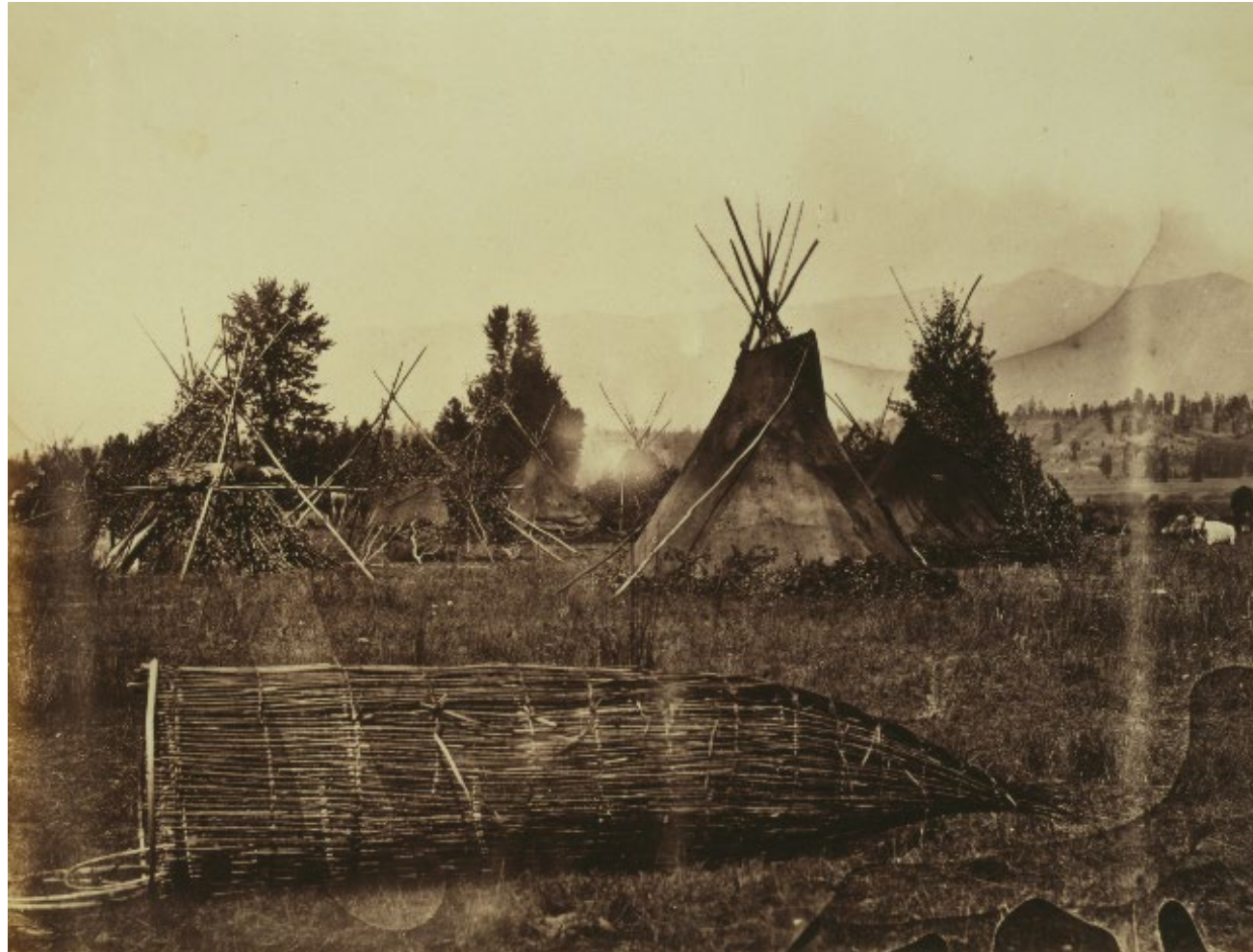
Fish trap Kootenai

Indian encampment, Tobacco Plains, Kootenay i.e., Kootenai River - fish trap in the foreground. British Columbia, 1861. Photograph. https://www.loc.gov/item/2003668216/ .