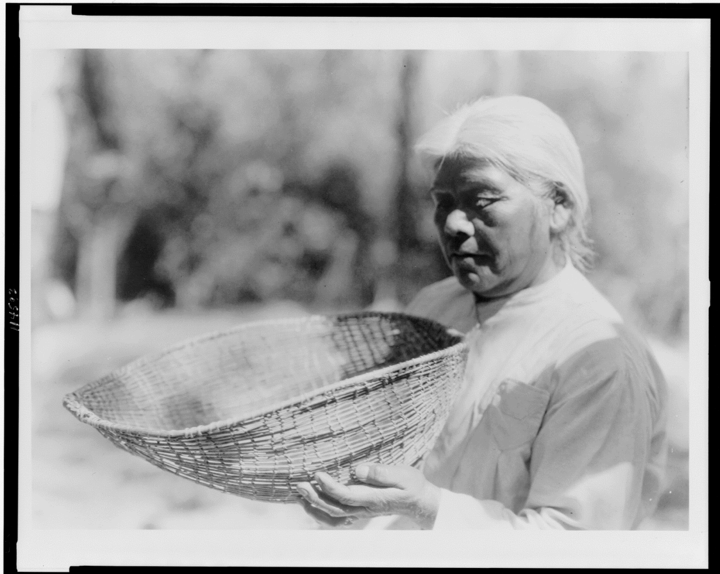
Sifting basket Miwok

Sifting basket- -southern Miwok. California, ca. 1924. Photograph.