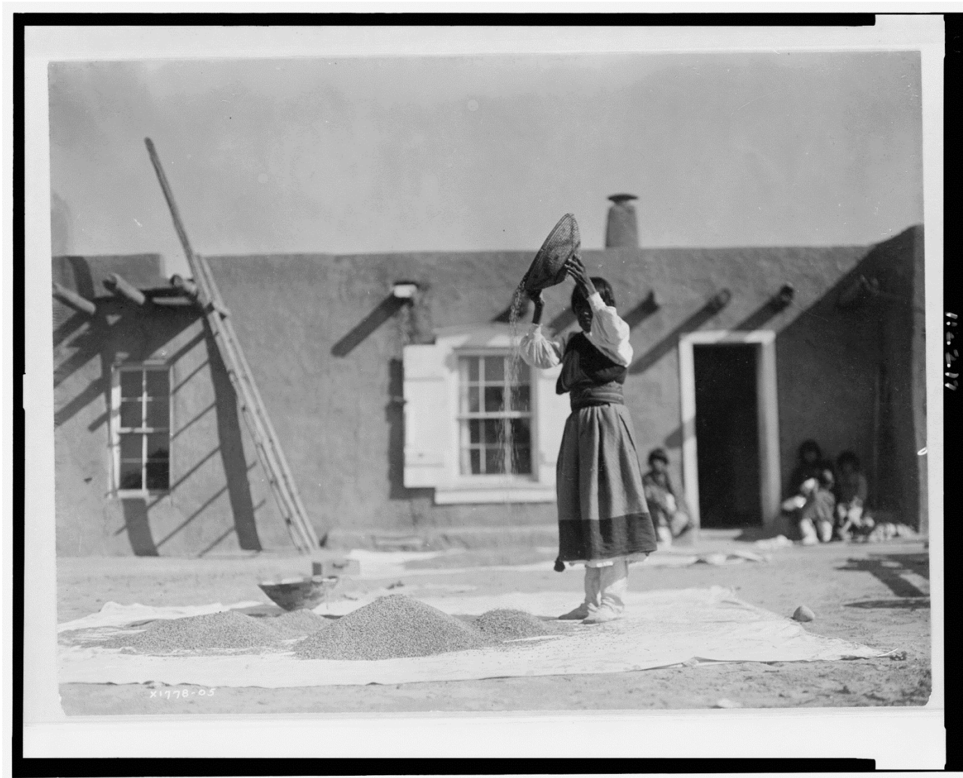
Winnowing wheat San Juan Pueblo

Curtis, Edward S, photographer. Winnowing Wheat . New Mexico San Juan Pueblo. ca. 1905. Photograph. https://www.loc.gov/item/9 4514165/ .