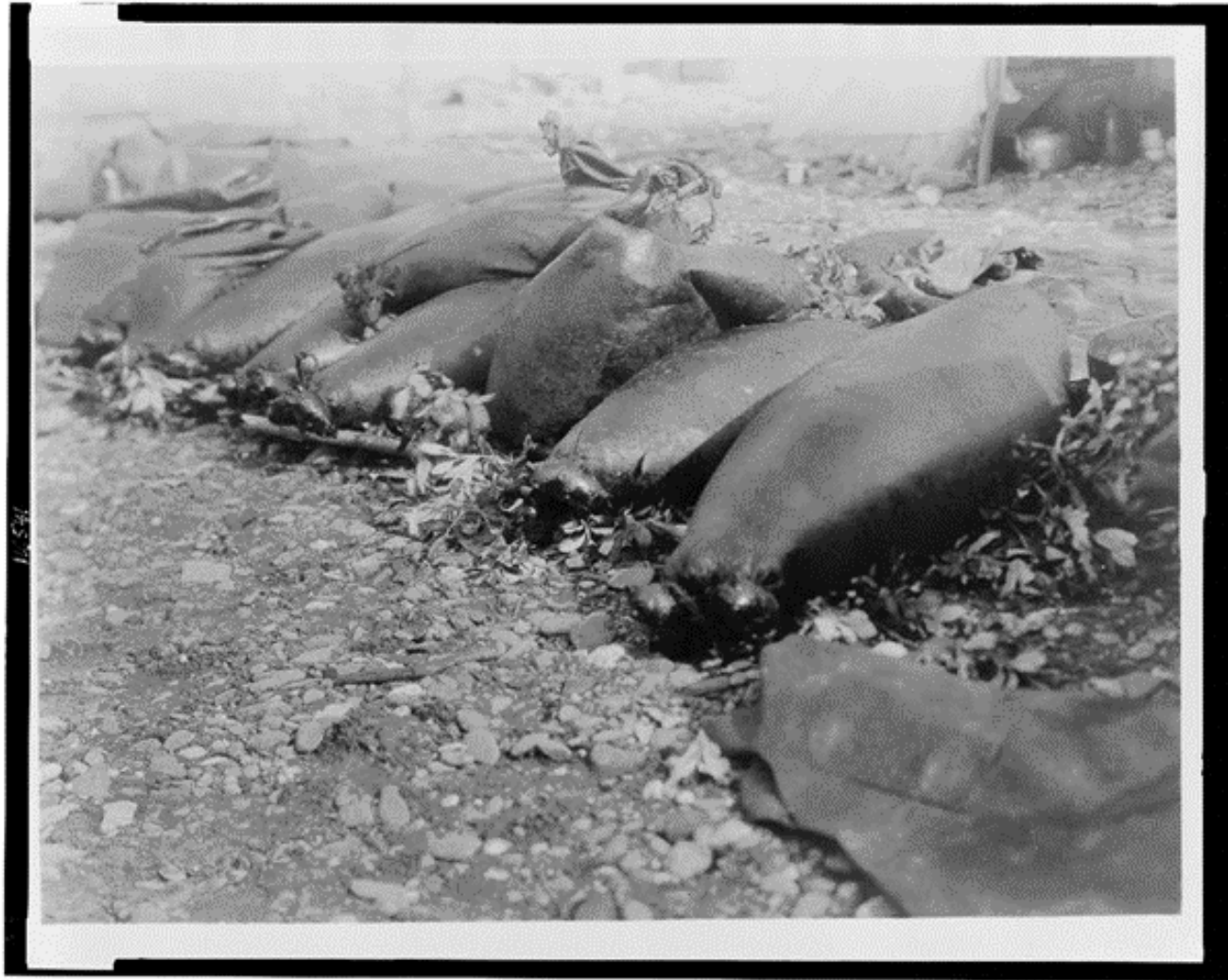
Seal skin food containers Eskimo

Curtis, Edward S, photographer. Food containers, Pokes-- Kotzebue . Alaska, ca. 1929. Photograph. https://www.loc.gov/item/ 96512915/ .