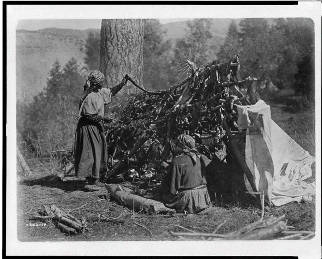
Drying meat Salish

Drying meat--Flathead. ca. 1910. Photograph. https://www.loc.gov/item/ 95505764/.