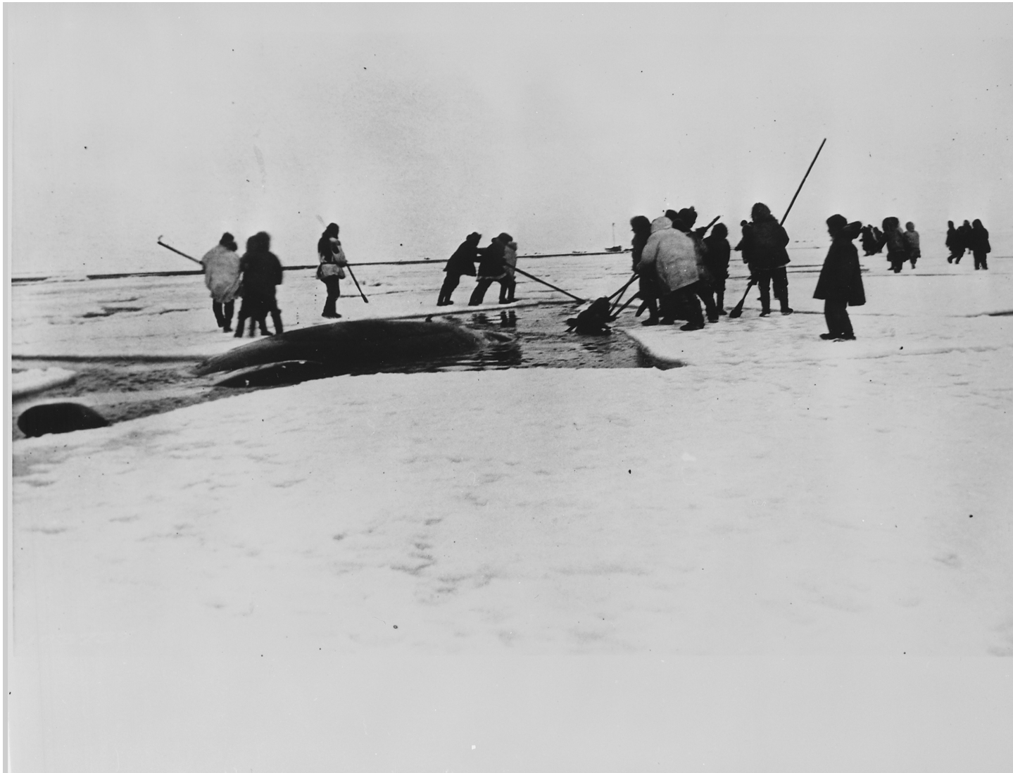
Harpooning a whale Eskimo (Alaska)

U.S. Army, photographer. Eskimos Harpooning a Whale, Point Barrow, Alaska. Alaska, 1935.