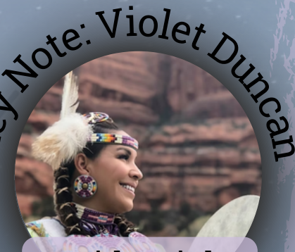
Residential & Day Schools