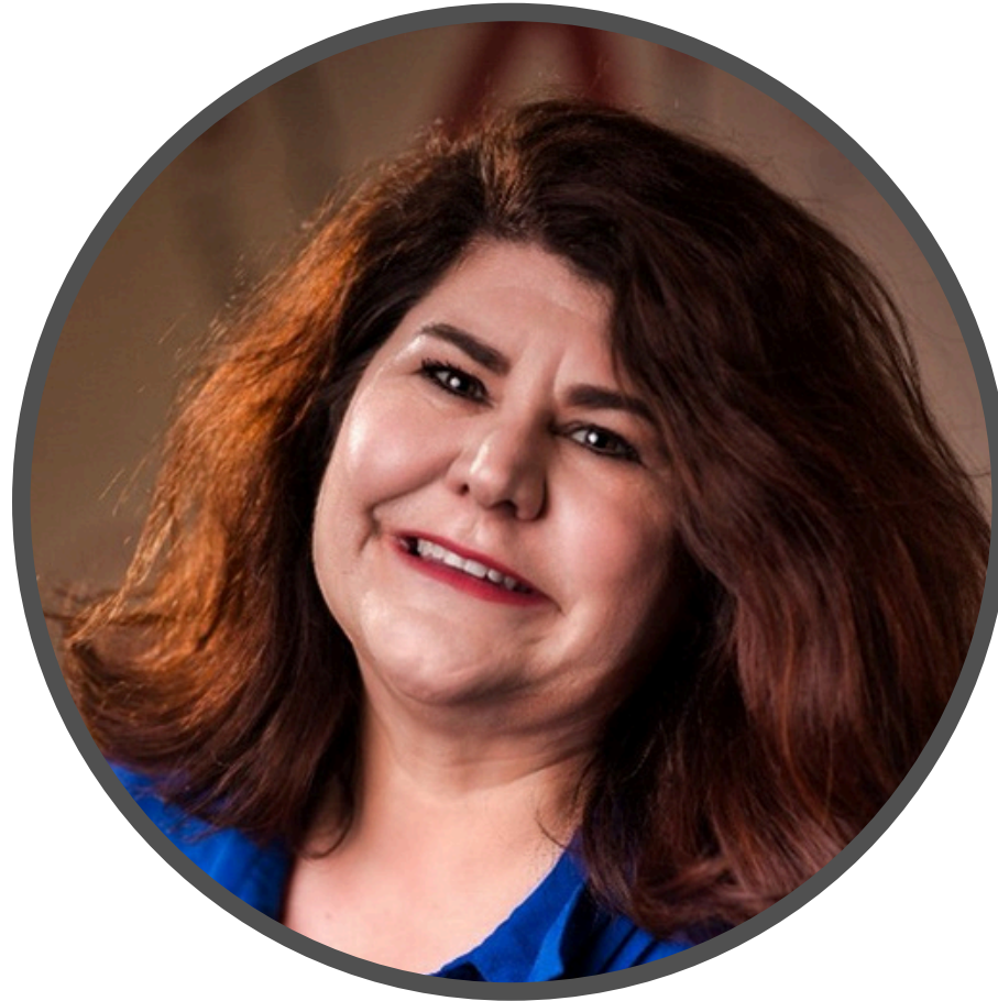
Chief Program Officer Montana Office of Public Instruction