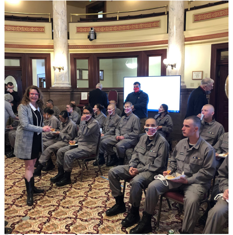
Welcome to the Montana Youth Challenge Class #44 cadets as we celebrate HB 556 - Provide alternative means of earning high school diploma