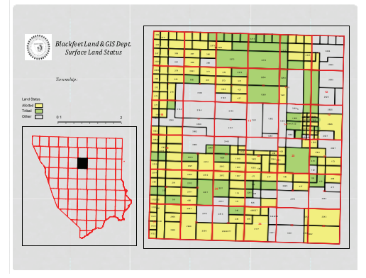
Fractionated Section Detail