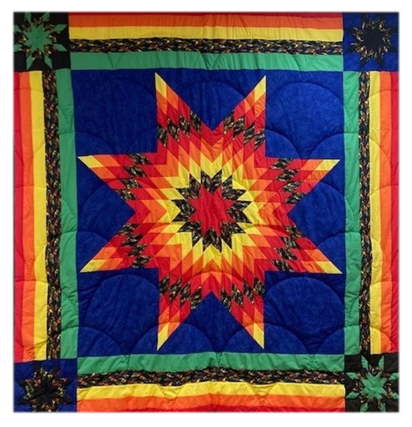
Star quilt presented to OPI by Hays Lodge Pole Elementary School (2004)