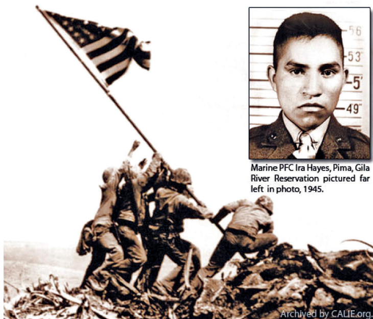
Iwo Jima, 1945.