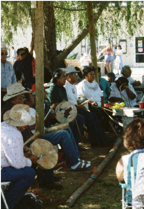
Hand games at the Fallon powwow