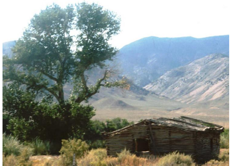
Landscape near Walker River