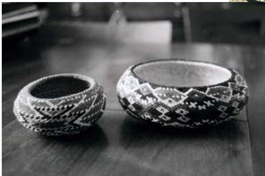
Beaded baskets by Rebecca Eagle Lambert