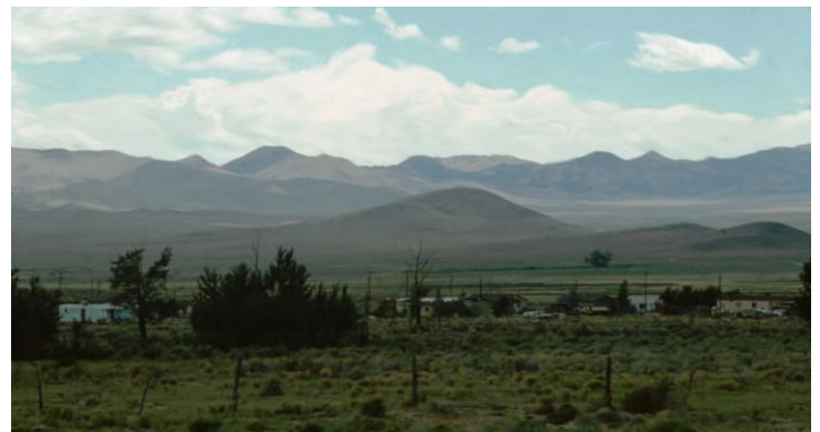
Landscape near Duckwater

The purpose of this writing, and the function to be served by the action suggested, is to gather critical information on the current situation, develop the necessary and appropriate relationships among tribes and other agencies, create program designs and organizational structures appropriate to Indian communities, and prepare high-quality fund-raising proposals to enlist the cooperative support of the agencies and institutions that can financially assist in the implementation of the major social and cultural change which the tribes of Nevada desire.