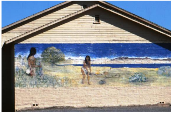
Tribal mural at Walker River Reservation

“We need tools and supplies; we need a place where tools and supplies can be centrally located.”