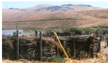
Willow corrals at McDermitt