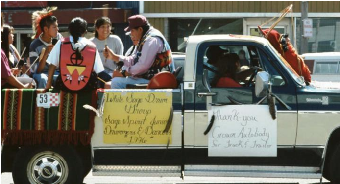
Float in the Fallon Indian Rodeo parade

• The Indian Days parade down Maine Street in Fallon is a wholly different matter from the imported form of the pow wow. It is a fine, strong showing of the vitality of Indian culture in the state. The regalia is turned out in colors, the vehicles dressed to the hilt, and there are exceptional floats. Baskets are hung all about