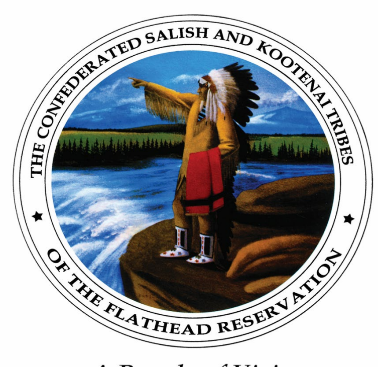
A People of Vision