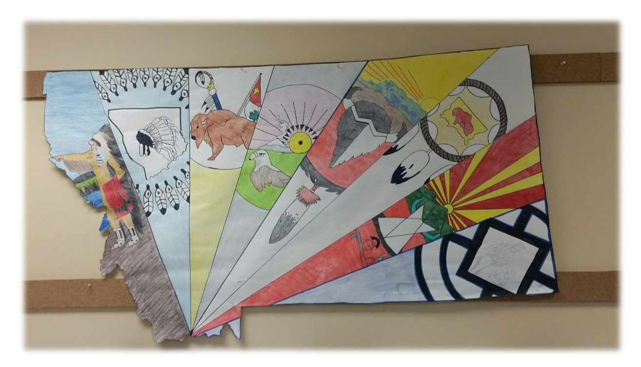
Artwork by Carroll College Education Students