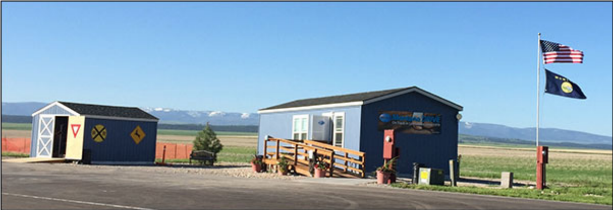
MT DRIVE Classroom and Storage Shed

In 2016, a new classroom building and storage shed was built to replace the aging trailers that served the program for nearly 40 years. As of 2017, over 14,000 drivers have been trained in Lewistown since the Office of Public Instruction Advanced Driver Training Program began the summer of 1979.