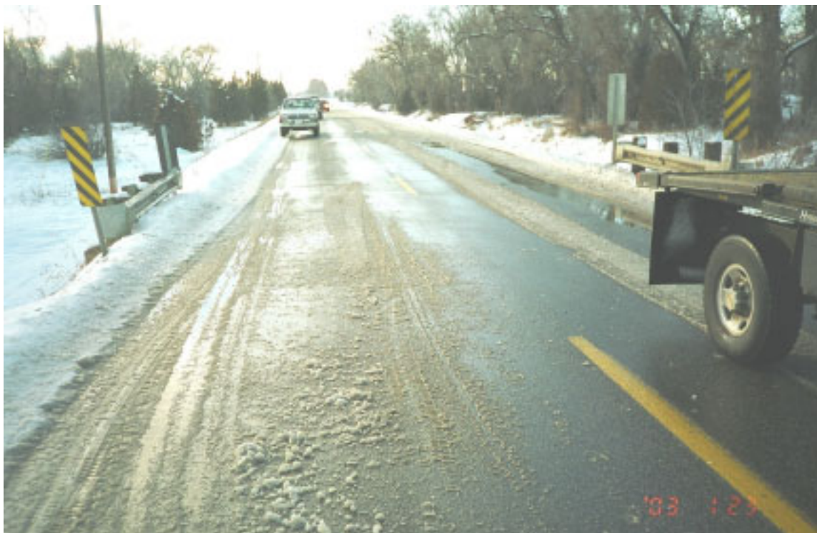
Figure 2. Roadway conditions at the accident scene.