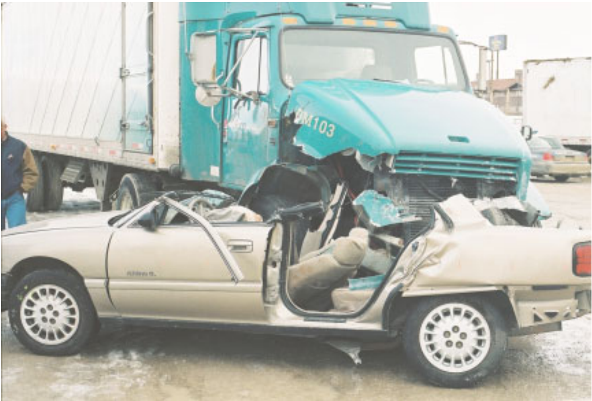
Figure 3. Vehicles aligned postcollision during accident reconstruction.