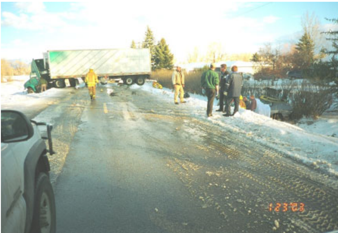
Figure 4. Vehicles at final rest.